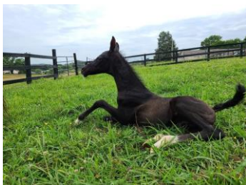
Adlumia Altair @1 week old

As many know, I have been on the lookout for a future herd sire of my own for several years, and in July I finally found him! Introducing Silver Hill Akhal-Tekes young upcoming sire, "Adlumia Altair" (Anduma x Ahmiyetli)! He is a black colt born 7/3/21, just in time for my Birthday (coincidence? I think not!).