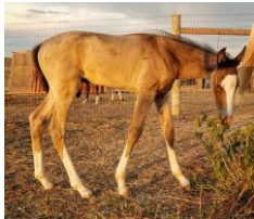
Silver Hill Jump'n Jax, Joshua American Horse x Amerka