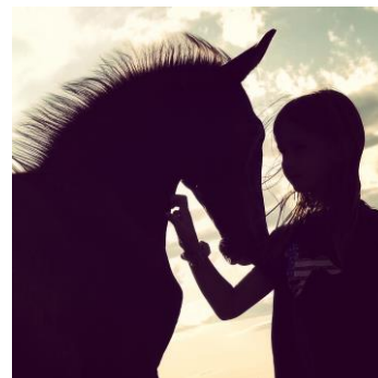
My daughter and Arriety

One more sad happening from this year...my daughter's Caspian horse had to be put down unexpectedly in May. We were all devastated (and still are). A suitable replacement has yet to be found, so if anyone knows/has a kid-friendly smaller sized horse (AT or AT cross would be a bonus!) for my 8-year-old to grow up with and use in Pony Club please contact me! We would even be okay with a long-term lease for the right horse.