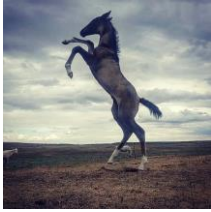
Silver Hill Arriety, 2021 smokey black filly, Tarek x SH Avienda