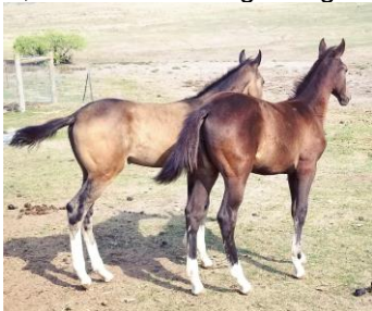
Left- Silver Hill Jump'n Jax, Right- Silver Hill Arriety, 3 months old

home in August; we'll miss having that goofy boy around.