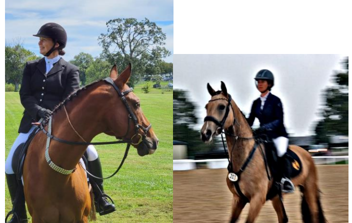
More Equitana shots