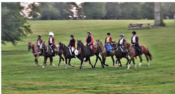
All Seven horses and riders during Equitana at one of the filming sessions.