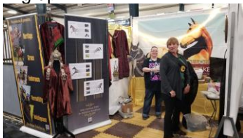
Our ATAA Booth, almost ready!

Anyway, we needed everything set up by Friday, the first day of Equitana, so everyone there helped out, in between getting horses settled, finding where everything was and catching up.